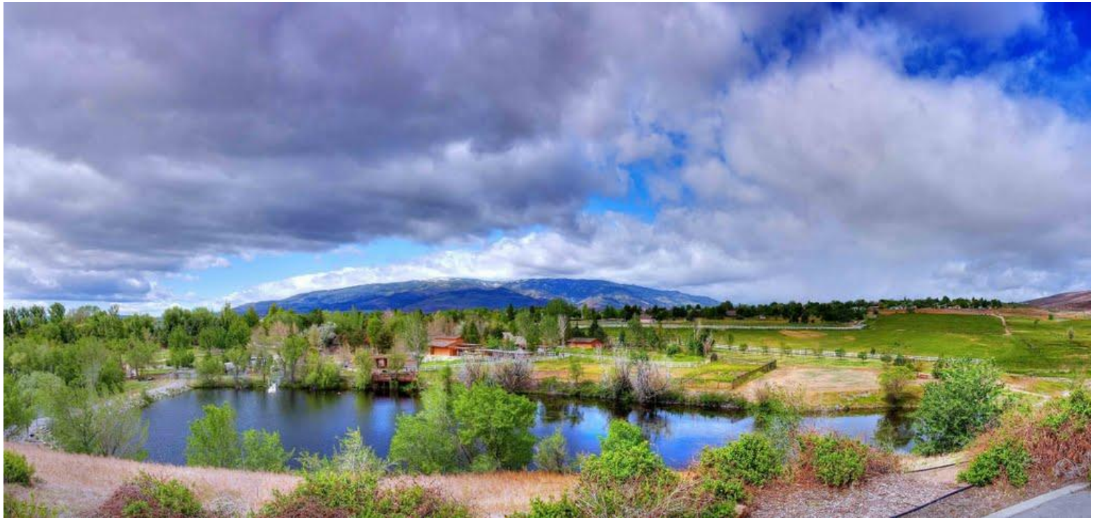
Rancho San Rafael Park, Reno